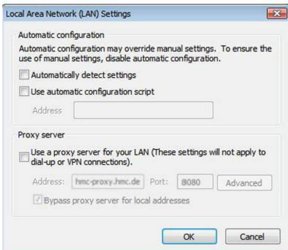
Figure 12: Local network

When using a company notebook, please ensure that the pre-set proxy server is deactivated. To do this in Internet Explorer, go to Extras -> Internet Options -> Connections and click on "LAN settings", then remove the tick from the proxy server box.