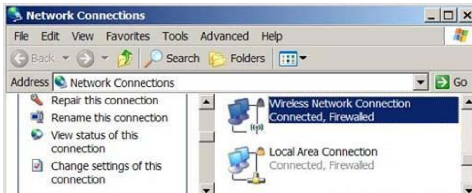
Figure 13: Network status

Under Start → Settings → Network connections, you can check the status of the wireless network connection.