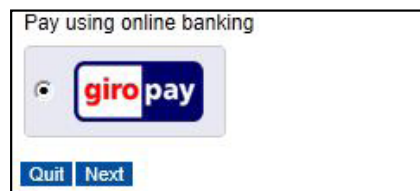
Figure 9: Select method of payment “giropay”

Click on “To the registration site” in the portal and choose the profile that meets your needs. The payment page will appear, where you can pay via online banking.