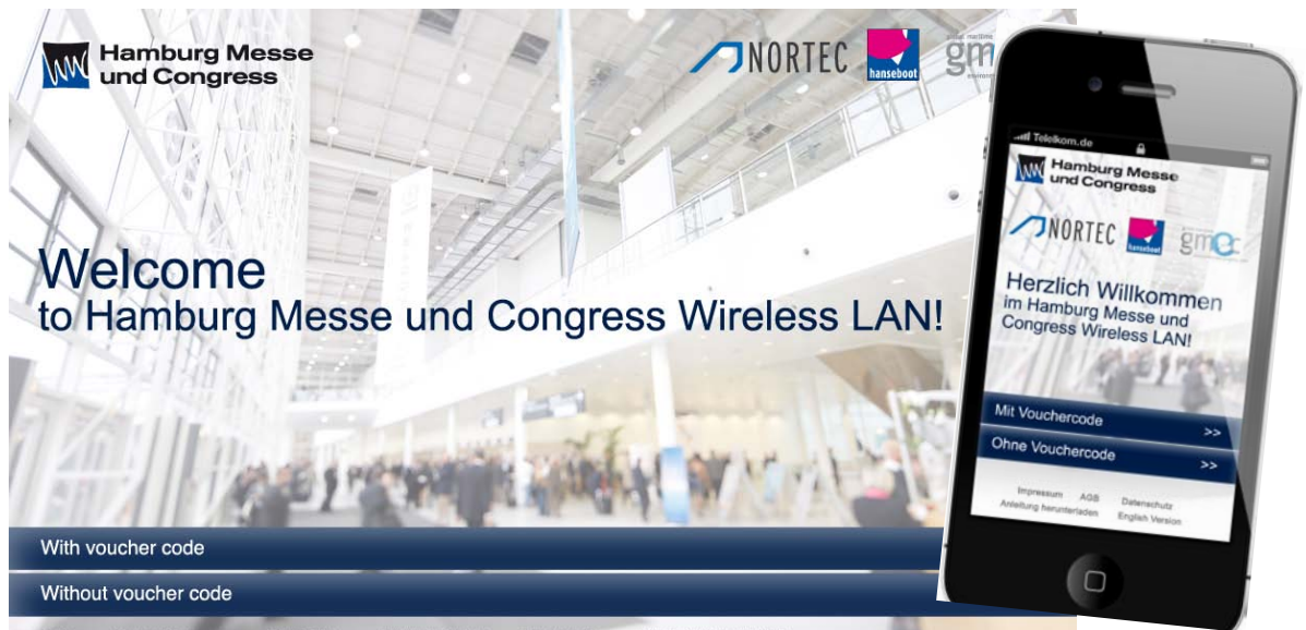
Figure 1: Homepage for the HMC wireless LAN portal

Since 2011, the Hamburg Messe und Congress (HMC) has offered you the opportunity to use a wireless LAN Internet connection. You can choose from various profiles (hour ticket or day ticket) and payment methods. Once you have made a connection to our wireless LAN, you will automatically be routed with your standard Web browser to the wireless LAN portal.